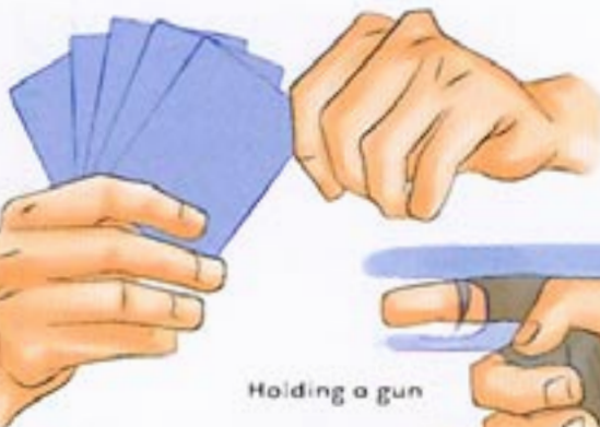
Holding a gun